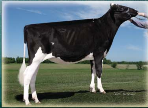
MDF TALENT BARBARA 37-ET Talent x EX-95 Outside x 2E-90 Milan x EX-5E Tony Beauty Can you picture her as a Sr. 2-yr old in 2013?! What a "Beauty-full" fall yearling!