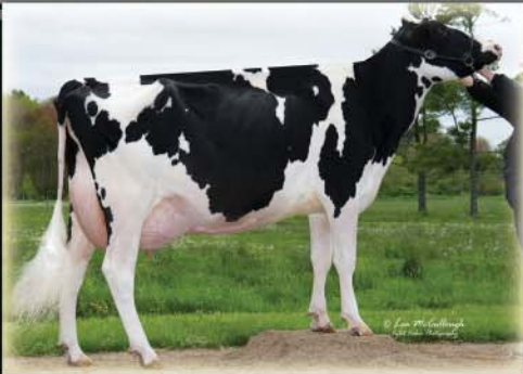
SAVAGE-LEIGH SHOTTLE LOLA-ET EX-92 3-7 305d 30.860M 4.1% 1.261F 2.8% 854P Lola sells due in July with ultrasound Goldsun female. Dam is Durham Licorice EX-92 x Bellwood Linda.