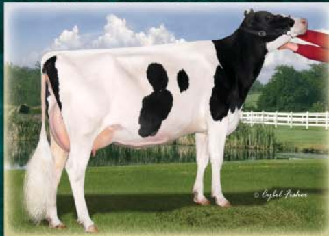
ERNEST-ANTHONY ABIGAIL-ET VG-87 2YR This Baxter dtr of Ambrosia 2E-95 sells. She's due Aug '12 to Goldsun. Her VG-87 2YR full sister also sells due Aug '12 to Goldsun. Baxter was another great cross on Ambrosia.