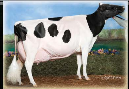
ERNEST-ANTHONY APHRODITE EX-95 2E She's a Stormatic x Ashlyn and has made a name for herself with many influential daughters. The selling dtrs include an EX-91 Goldwyn, three VG Goldwyn dtrs and other dtrs by Jordan & Windbrook!

SALE LOCATION: COWTOWN HOLSTEINS, DERBY, VT