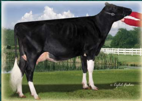
ANGELAS JASPER ANGELIC-ET VG-88 2YR You can see all the potential in this Jasper Sr 2-Yr-Old. Then look at her pedigree... Dam is EX-91 Durham x 2E-96 Angel x All-World Ashlyn. She is due again in November to Sid.