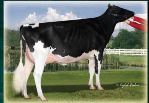
ERNEST-ANTHONY AMAZE-ET VG-87 2YR She's a Shottle from Goldwyn Astonish EX-91 x Aphrodite 2E-95 x Ashlyn. Picture-perfect mammary - wait till you see it in person!